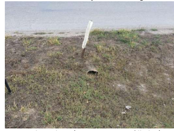
Reach 4 culvert (note structure is filled in)