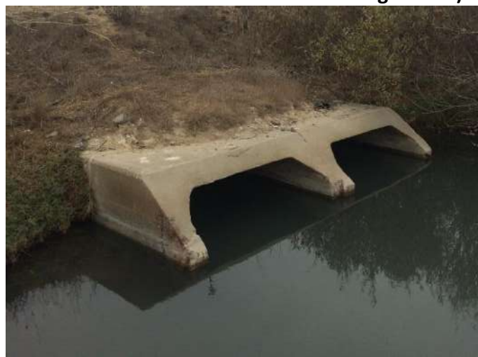
Reach 3 dual concrete culverts