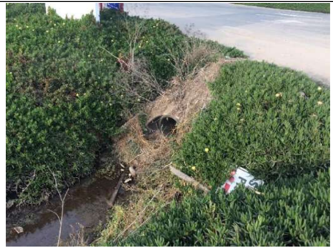
Reach 2 culvert by Bennett Slough