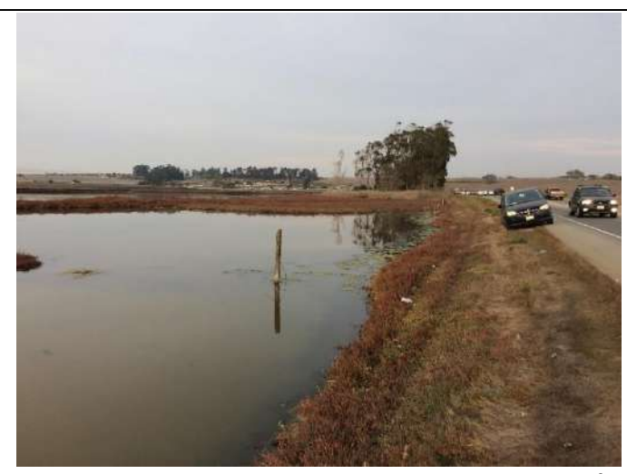
Reach 1 culvert located underneath vegetation)